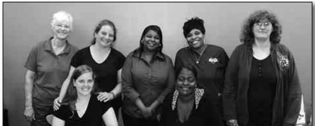
Five women are happily embarking upon the H.O.P.E. journey.